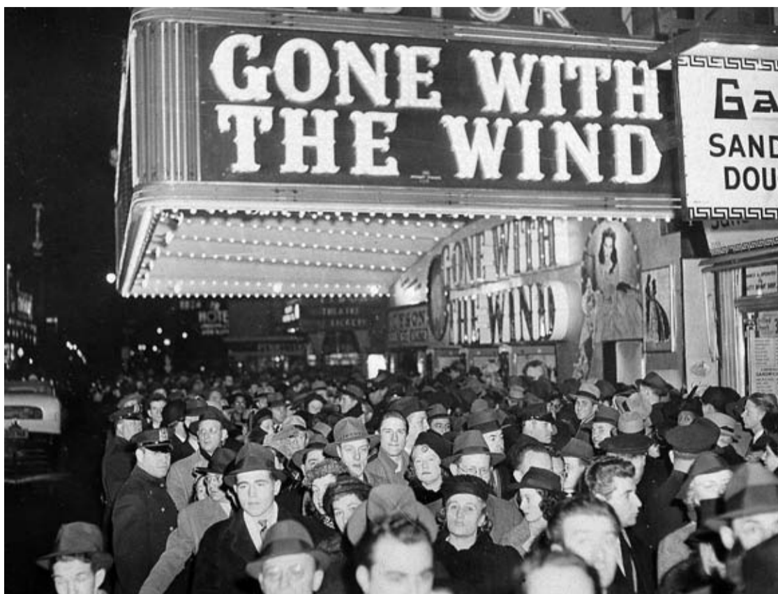
In this Dec. 19, 1939 file photo, a crowd gathers outside the Astor Theater on Broadway during the premiere of "Gone With the Wind" in New York.

NEW YORK (AP) — HBO Max has temporarily removed "Gone With the Wind" from its streaming library in order to add historical context to the 1939 film long criticized for romanticizing slavery and the Civil War-era South. Protests in the wake of George Floyd's death have forced entertainment companies to grapple with the appropriateness of both current and past productions. On Tuesday, the Paramount Network dropped the long-running reality series "Cops" after 33 seasons. The BBC also removed episodes of "Little Britain," a comedy series that featured a character in blackface, from its streaming service. In an op-ed Monday in the Los Angeles Times, the filmmaker John Ridley urged WarnerMedia to take down "Gone With the Wind," arguing that it "romanticizes the Confederacy in a way that continues to give legitimacy to the notion that the secessionist movement was something more, or better, or more noble than what it was — a bloody insurrection to maintain the 'right' to own, sell and buy human beings." In a state-